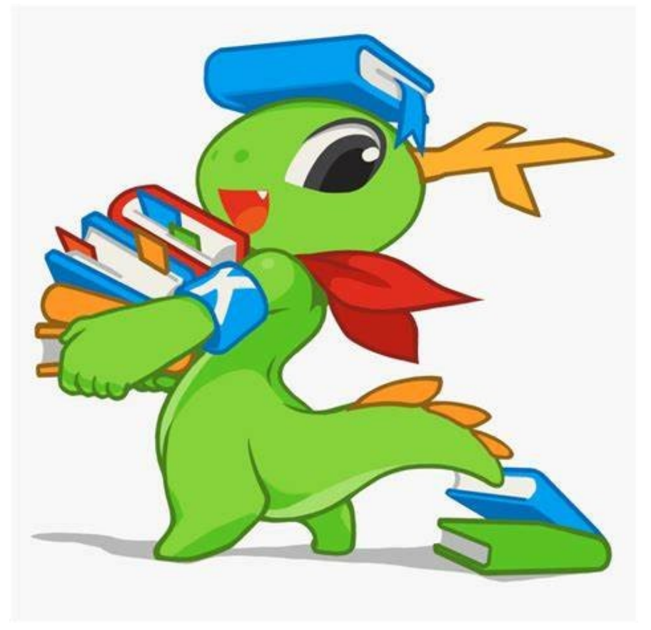
Everyone likes History, right?